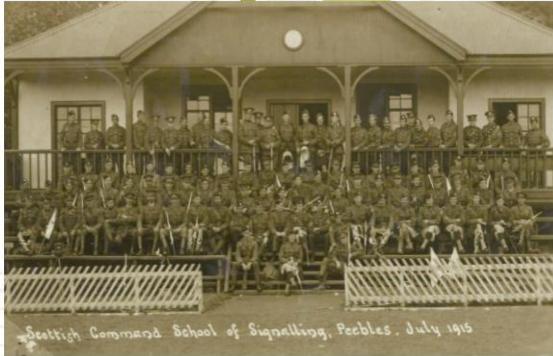
MIA 2/29 A.A. Macfarlane Grieve photo album July 1915 Scottish Command School of Signalling, at Peebles, on seating in front of a pavilion, officers and ORs, in uniform, with flags, also lamps, 103 present. Digitised material for Durham University Library Miscellaneous Photograph Albums 2 - A.A. Macfarlane Grieve / MIA 2/29

This photograph, from the archive at Durham University, shows the Scottish Command School of Signalling posing for a school photo.