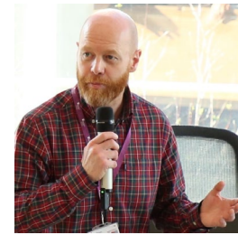
Senior Manager Career and Professional Growth