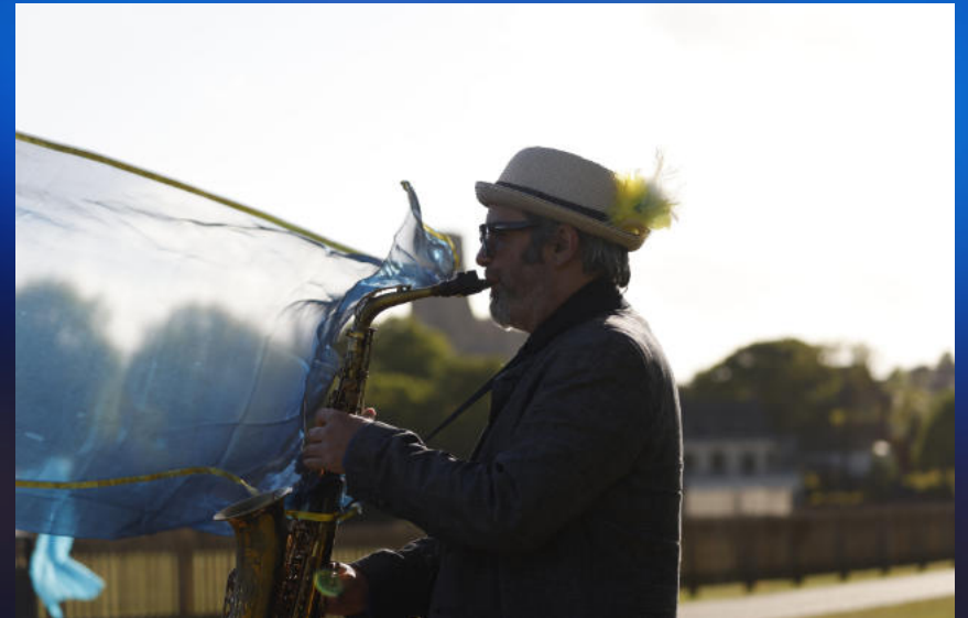
Music, Dance and Fabric