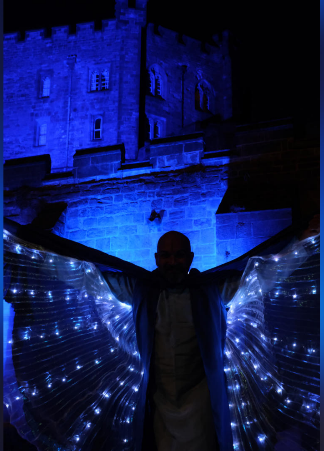
A Blue Cathedral