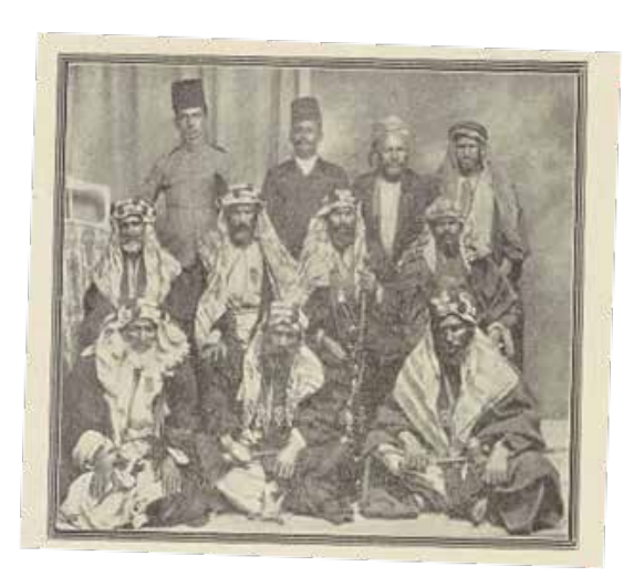
Image 3: Some of the shaykhs of the Lahyawat and the Teaha and the Tarabin. Standing behind them, some of the members of the Egyptian delegation.

However, according to British sources, the Teaha mostly leaned on the Anglo-Egyptian side.<sup>113</sup> Loyalty could also shift. Two shaykhs, for example, which had been long supported by annual subventions from the Egyptian Government, decided to switch over to the Ottoman side. While Ottoman sources - Rushdi