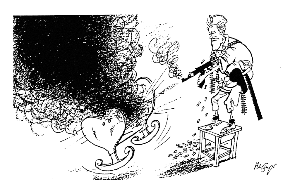
Kosovo—the cradle of the Serbian people.