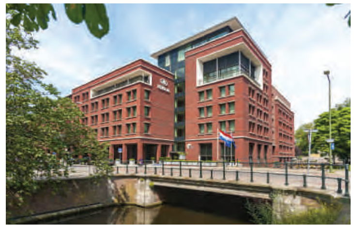
Hilton, The Hague

The hotel is a short taxi or tram ride from the central station which has trains arriving every 20 minutes from Amsterdam airport. The hotel is a 5 minute walk from the Peace Palace.