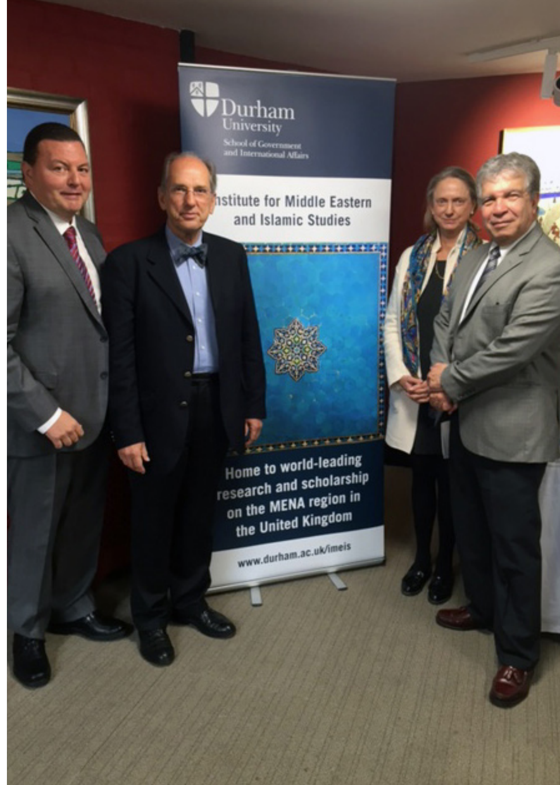
Right: Speakers at the IMEIS relaunch, Durham

To conclude, the lament about the International Relations/Political Science and Area Studies divide is rather an old, and even tired one. It needs to be superseded by an acknowledgement of the bridge-building that is currently on going and efforts to continue it by scholars around the world – this is an important part of what is today called ‘Global IR’. New trends in the Social Sciences which ignore local realities in the search for generalizable trends, reveal precisely how very important Area Studies is to provide the kind of empirical knowledge and analysis that is absent in much modern research. Without it we surely cannot pretend to better understand the politics of change in the Middle East or in the wider world.