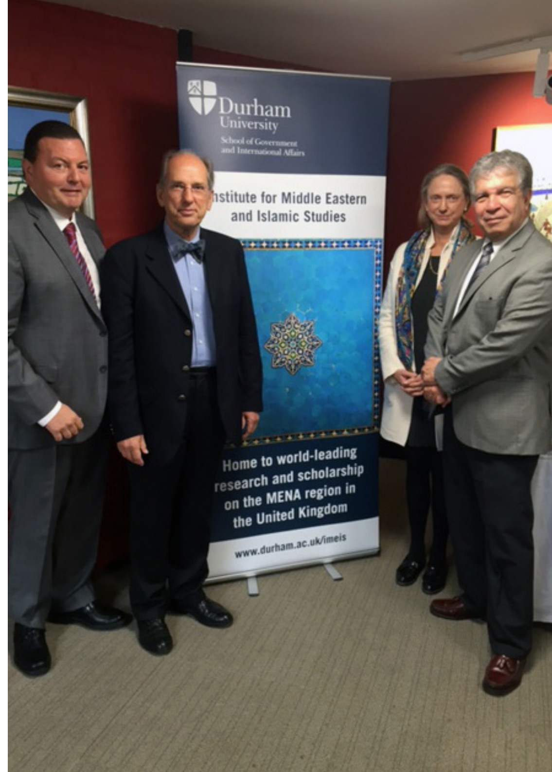
Right: Speakers at the IMEIS relaunch, Durham

To conclude, the lament about the International Relations/Political Science and Area Studies divide is rather an old, and even tired one. It needs to be superseded by an acknowledgement of the bridge-building that is currently on going and efforts to continue it by scholars around the world – this is an important part of what is today called ‘Global IR’. New trends in the Social Sciences which ignore local realities in the search for generalizable trends, reveal precisely how very important Area Studies is to provide the kind of empirical knowledge and analysis that is absent in much modern research. Without it we surely cannot pretend to better understand the politics of change in the Middle East or in the wider world.