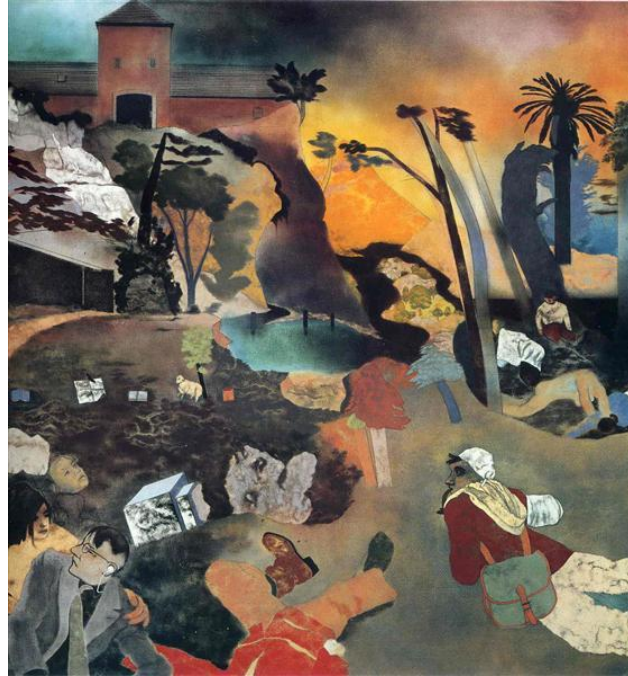
R.B. Kitaj, If Not, Not (1975)