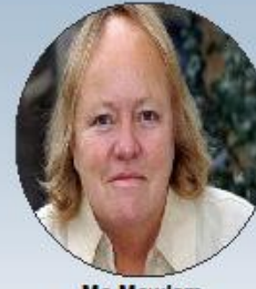
Mo Mowlam (Sociology and Anthropology 1971) Former Northern Ireland Secretary who achieved a historic breakthrough with the Good Friday Agreement.