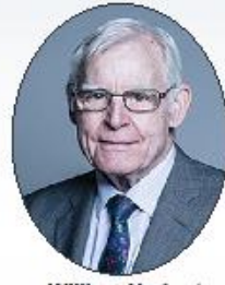
William Herbert Laming (Baron Laming, CBE, PC) (Applied Social Studies 1960) A British social worker and member of the House of Lords.