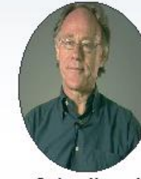
Graham Hancock (Sociology 1973) Author of 'The Sign & the Seal', 'Fingerprints of the Gods', 'The Message of the Sphinx', 'Entangled', 'War God', 'Magicians of the Gods'.