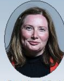
Emma Lewell-Buck (Social Work 2007) Shadow Minister for Children & Families, MP for South Shields.