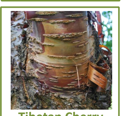
Tibetan Cherry My bark is so shiny and so smooth, feel me...