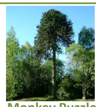
Monkey Puzzle People think my trunk looks like a huge elephants foot!