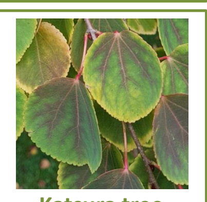
Katsura tree My leaves smell like burnt sugar or candy floss, pick some up ....