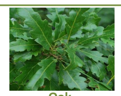
Oak Look at my funny leaves, they have 'lobes' just like your ears!