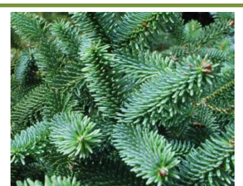
Hedgehog Fir My shoots look like tiny hedgehogs.

Start in the Children's garden then follow the path down the garden to the monkey puzzle, map no 21. From there cross the ponds and finish at the "Vessels of life" sculpture. Along the way you will meet some of OUR favourite and special trees.