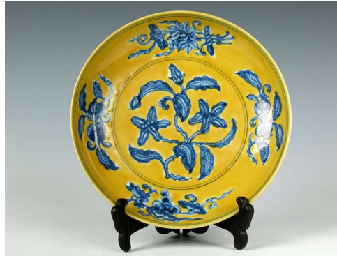
China. Blue and Yellow Porcelain dish, Ming Dynasty