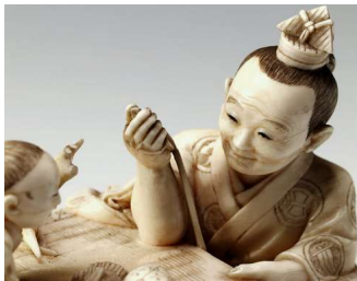
Japan. Detail of an Ivory Figure