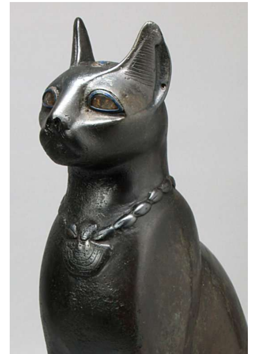
Egypt. Detail of Cat Mummy coffin