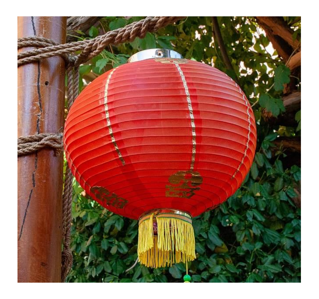
A red Chinese lantern

5. Using tape, attach the strip you cut off as a handle at the top. You can add some tissue paper tassels along the bottom edge too.