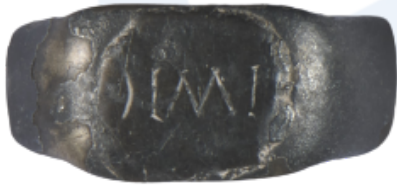
Roman Ring belonging to a citizen