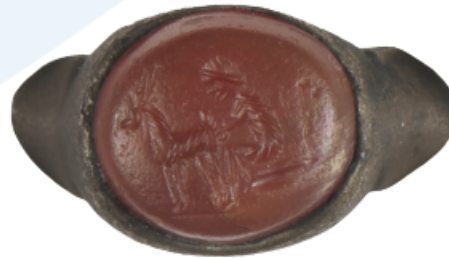
Roman Ring with man milking goat