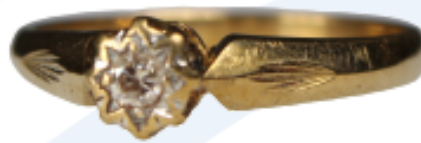
1862 Gold Engagement Ring