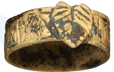
Silver Faith Ring for couples