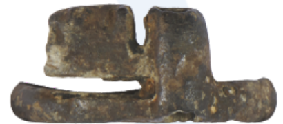
Roman Key Finger Ring