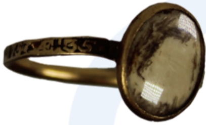
1935 Mourning Ring with hair in stone

Can you design some rings that you would like to wear? You can write a word that you like, or draw a picture of something that is special to you!